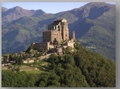
St Michael Abbey - Avigliana

Another branch of the valley is the Col de Montgenèvre and Sestriere , also known as one of the most important tourist locations of the region. The high Susa Valley is a paradise for lovers of nature , trekking, mountains and skiing , with accommodation at the highest level, but also with remote villages in the dense woods, where time seems to stand still.