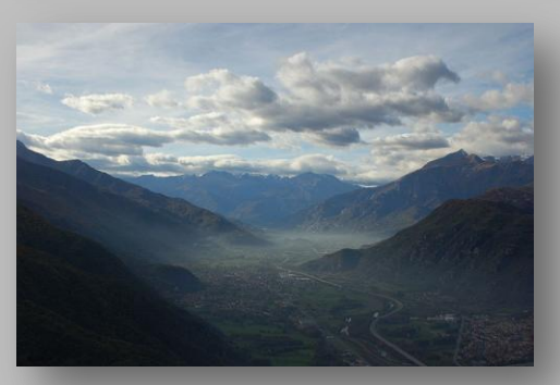
View of the Susa Valley